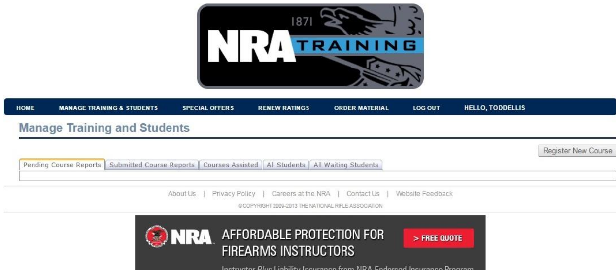
Figure 1. How to register a new NRA course at www.nrainstructors.org . Instructors must first log in using their user name and password.